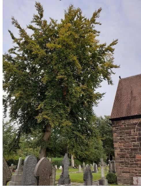
Beech tree within the churchyard (shown in summer) – east facing and west facing views.

Currently tree roots are lifting and moving gravestone memorials and the ground of the historic graves in this section of the churchyard, as well as flagstones of the adjacent path (see below).