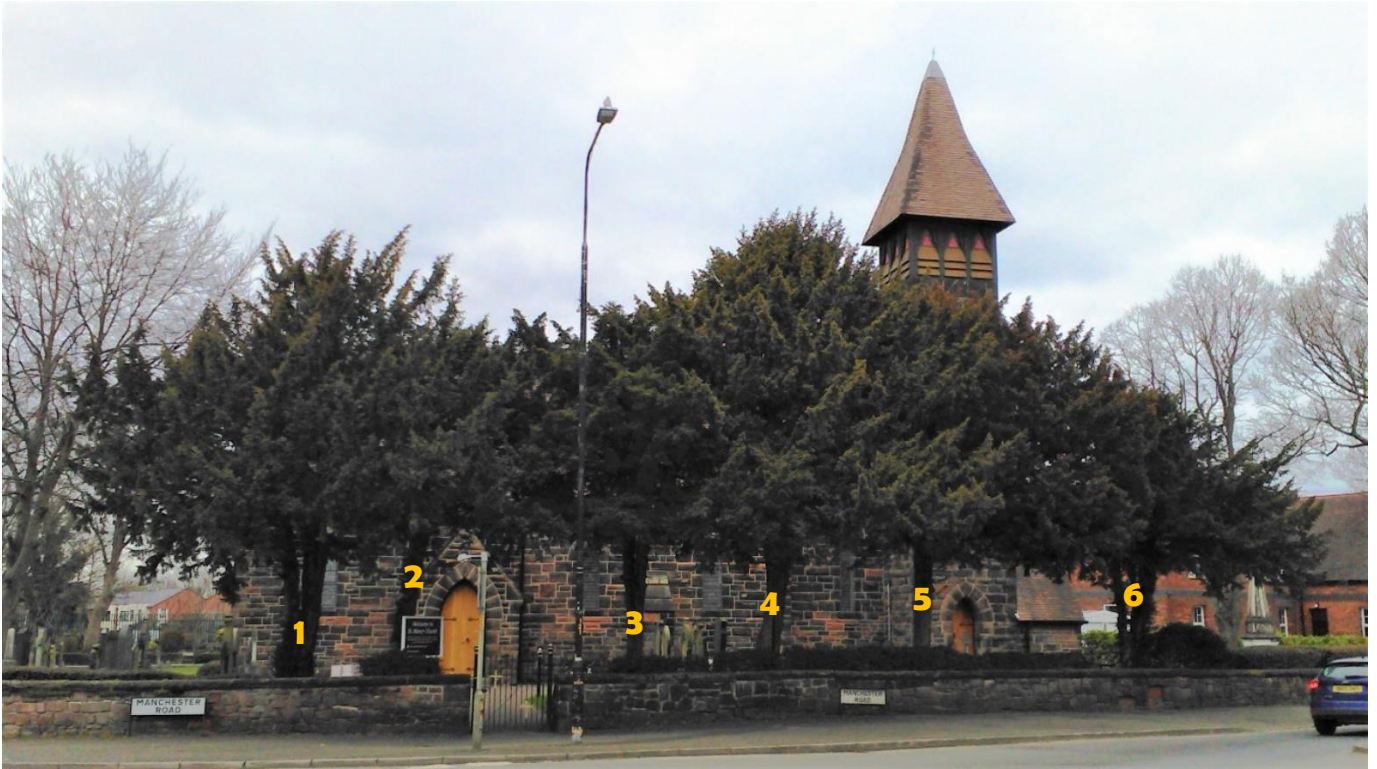
Line of Yew Trees in front of St. Mary's Church Numbered 1 to 6.