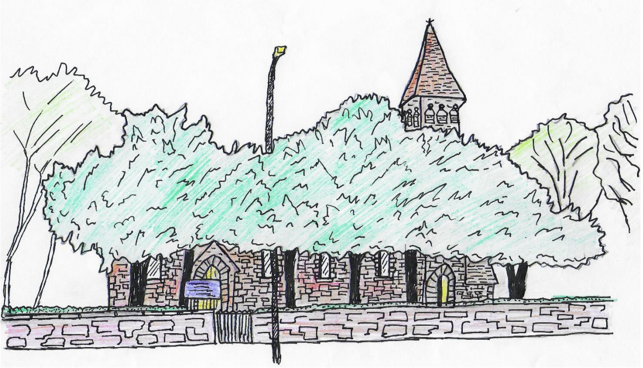
Artist's impression of the current yew tree coverage of St. Mary's church building, viewed from the village.