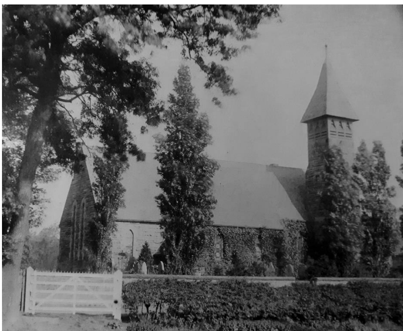
Historic photograph of St. Mary's Church circa. 1906.

The yew trees were not present in an older picture taken in circa. 1906 in which the church is framed by poplar trees which are no longer present.