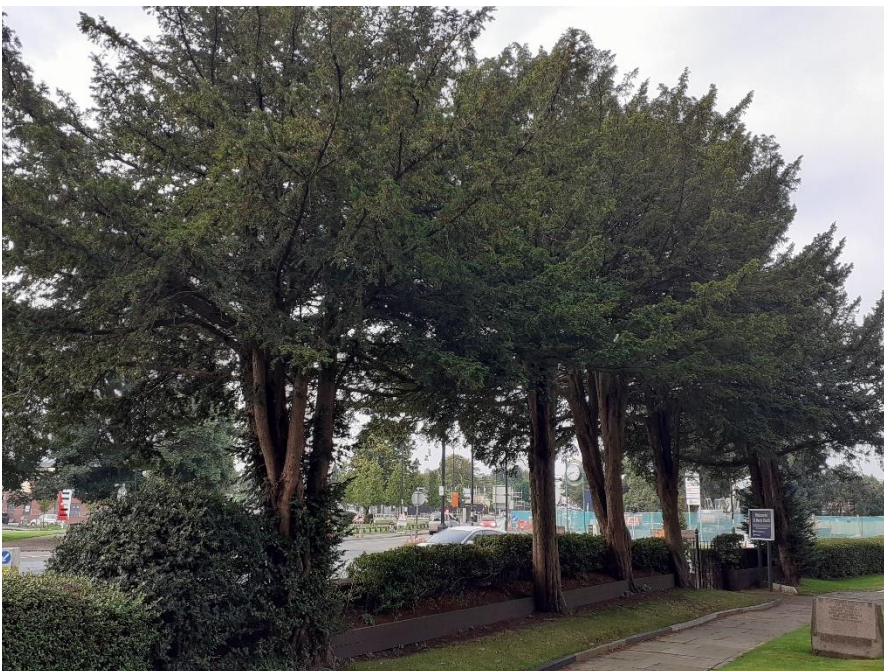
Line of Yew Trees viewed from the churchyard, looking towards the village centre.