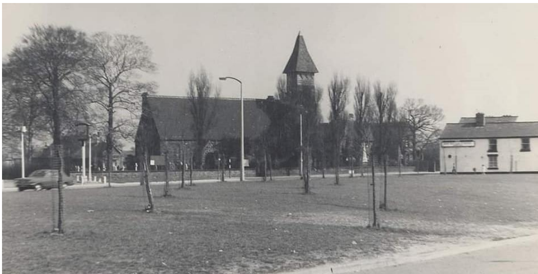
Historic photograph of St. Mary's Church circa. 1970-80.

What may have been appropriate for their size and position on planting may not be so now many years later, and doing nothing means that our assets turn into our liabilities and significant costs in maintenance and repair for a future generation. An historic photograph in a collection belonging to Trafford Council shows a view of the church from the village centre in the 1970-80s where the building itself is far more visible. The yew trees are just visible, but are a much more appropriate smaller size.