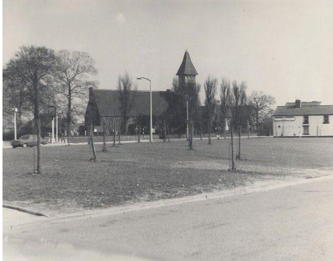
Historic photograph of St. Mary's from the village.