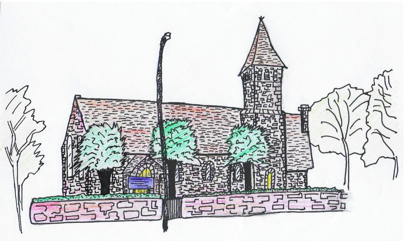
Artists impression of the view of St. Mary's church building following the removal of 3 of the 6 yew trees and reducing the crown size of the remaining trees.